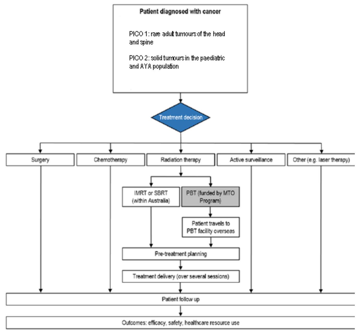
Figure 1 Current clinical management algorithm for PICO 1 and PICO 2

PBT to the current clinical management algorithm would increase the radiation therapy options available in Australia.