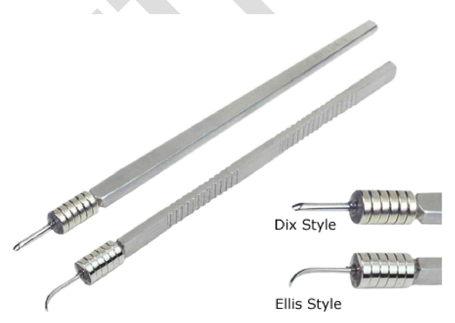
Figure 1 Examples of spuds used in the removal of corneal foreign bodies (GLC 2012).

Management of a patient presenting with a CFB in the first instance requires irrigation with saline, which may be sufficient to clear loosely adherent particles, and identification of all particles. Slit lamp examination is then used to determine how deeply the CFB has lodged. Following application of a topical anaesthetic, a hypodermic needle, spud or other purposely designed instrument is used to remove the foreign body (see Figure 1). The aim is to remove the foreign body with as little as possible disruption of the surrounding tissues. This reduces the risk of corneal scar tissue formation and provides the best conditions for uncomplicated recovery (COO 2011; NSWDH 2009).