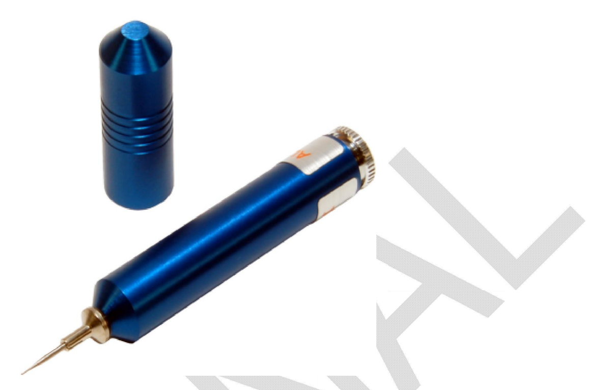
Figure 3 The Algerbrush with 0.5mm burr attachment (STAR 2012).

contact is made with Bowman's layer, the corneal layer directly below the epithelium, and therefore perforation of the cornea with this device is rare (COO 2011; NSWDH 2009; Smay 2002).