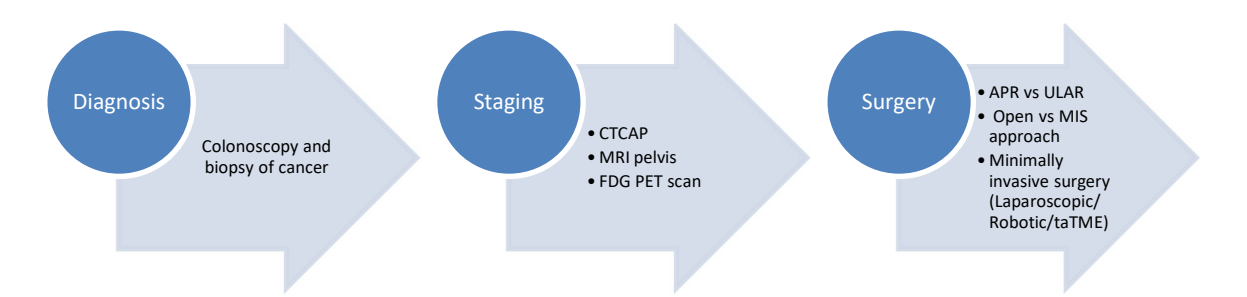
Figure 2: Usual pathway for rectal cancer patients

The pathway would be the same as standard rectal cancer treatment pathway. If after discussion at the MDT, a taTME approach was recommended this would then be undertaken.